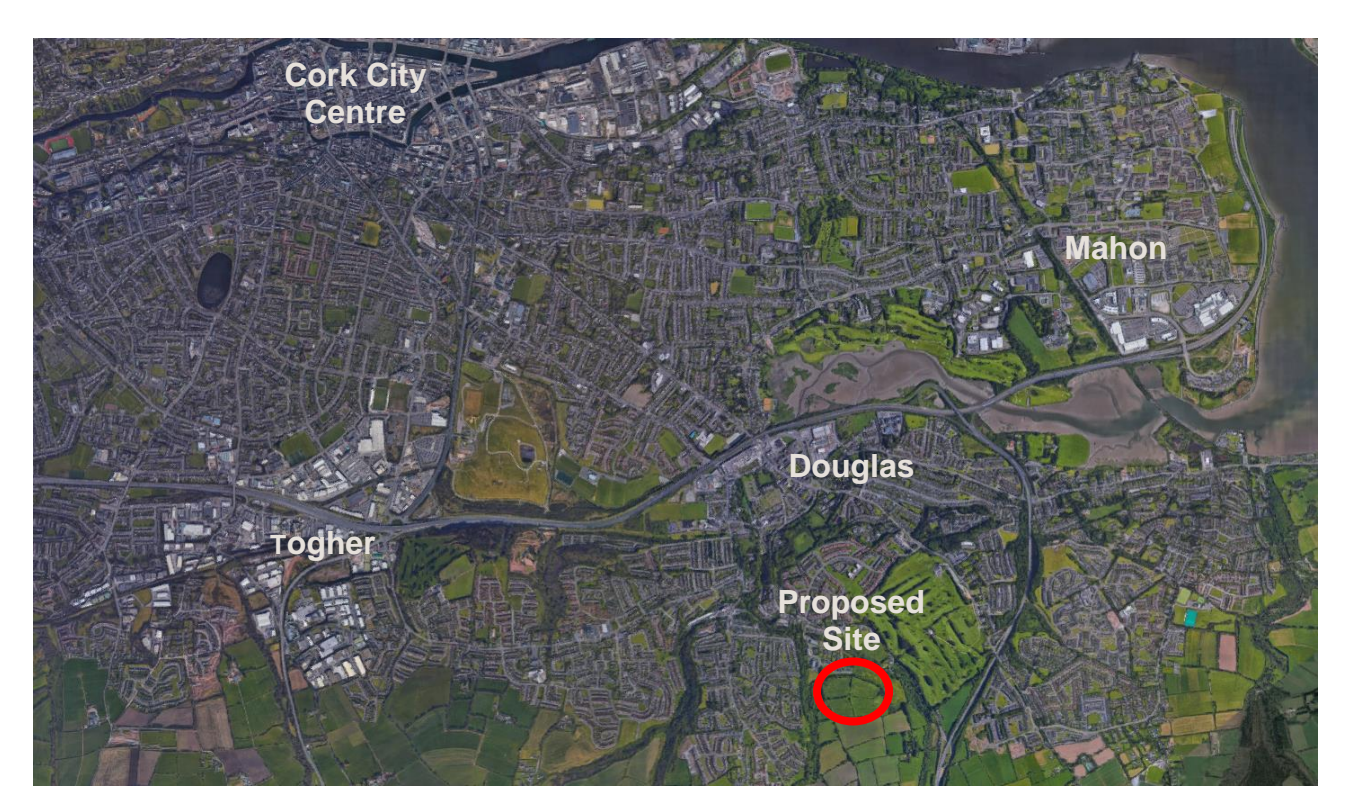
FIGURE 1: LOCATION OF PROPOSED DEVELOPMENT IN CONTEXT OF DOUGLAS, AND OTHER RELEVANT POPULATION CENTRES TOGHER, MAHON AND CORK CITY